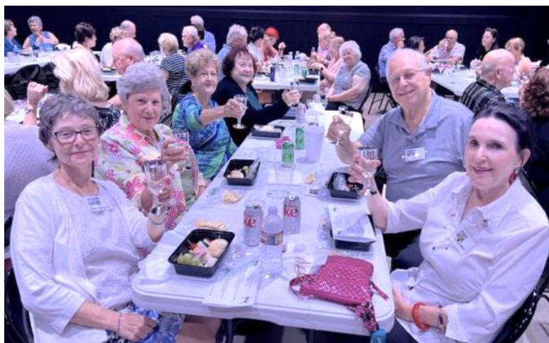
GHS members celebrate at last year's Wine Tasting.